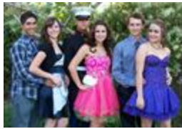
Photo circa Fall 2011/12 Goddard Homecoming